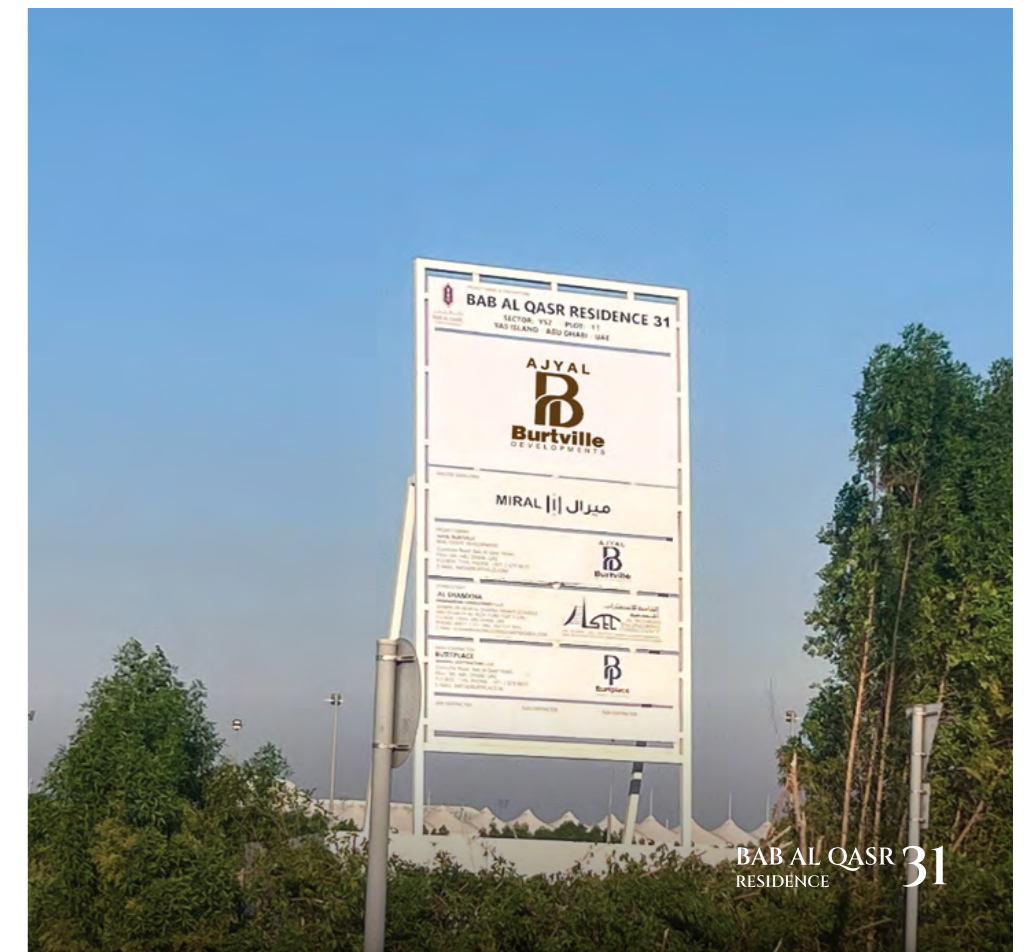
BAB AL QASR RESIDENCE 31