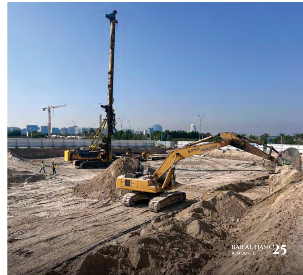
BAB AL QASR RESIDENCE 25