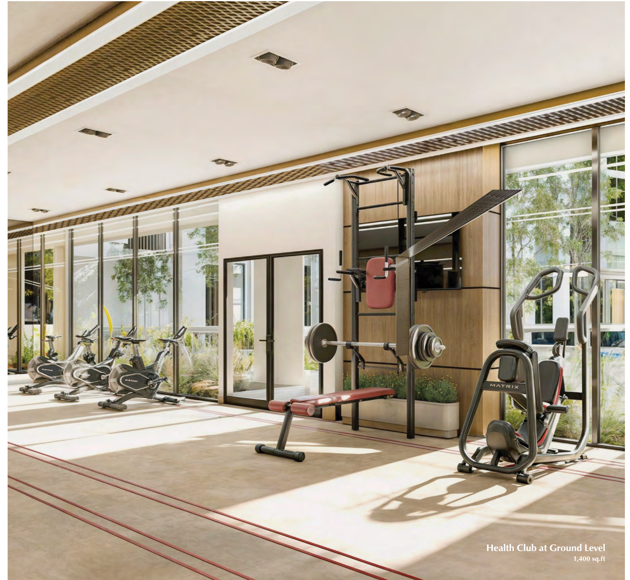
Health Club at Ground Level 1,400 sq.ft